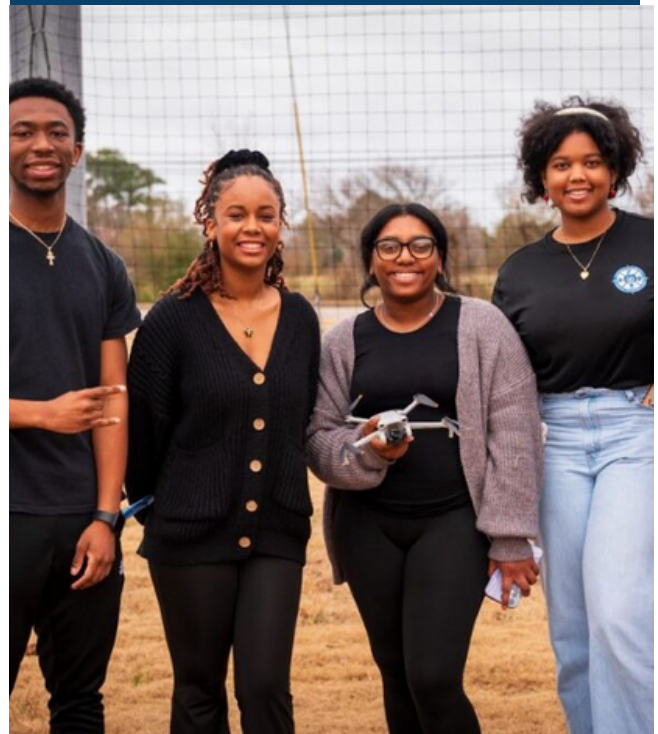
ECSU CERT Students