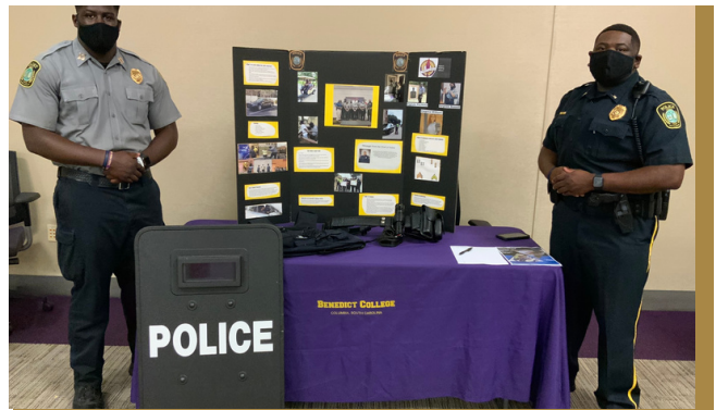
Benedict College Campus Police