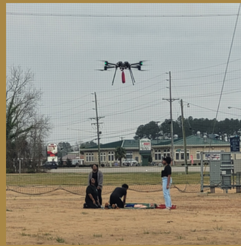
ECSU EM/CERT students using BFD drone to airlift an AED to CERT members in the field doing CPR on a patient as an exercise on how drones can be utilized in public safety.