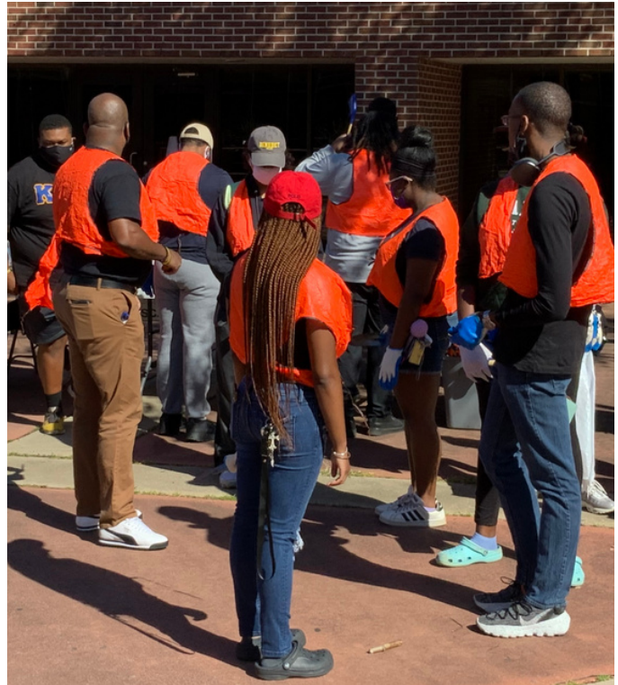
Benedict CERT Volunteers